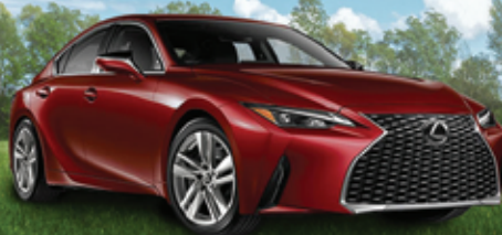
2023 LEXUS IS 300