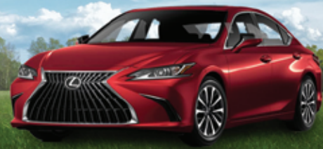
2023 LEXUS ES 350

For more information call (956) 800-4085 | See below for more prizes | Non Profit Tax ID: 74-2938538