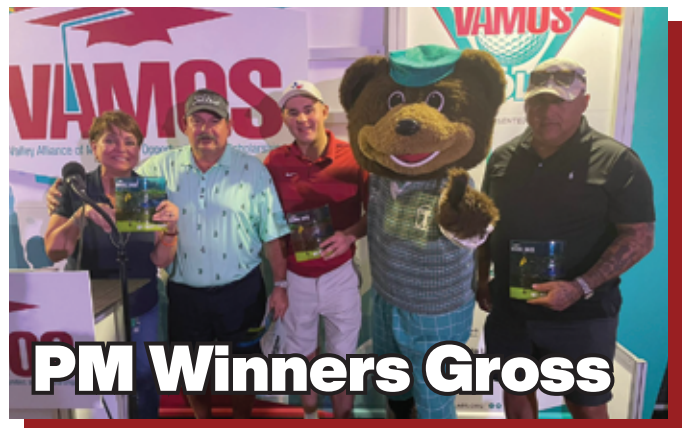
PM Winners Gross