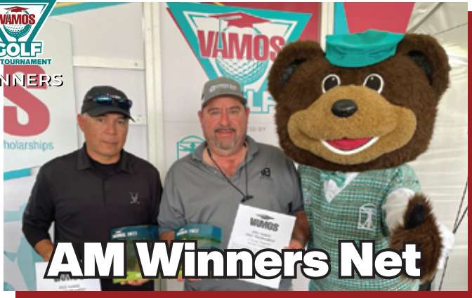
AM Winners Net