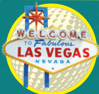
Trip to Las Vegas

Join us at the Premier Golf Tournament of the Rio Grande Valley