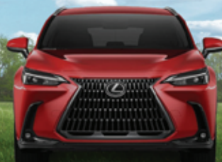
2023 LEXUS NX 300