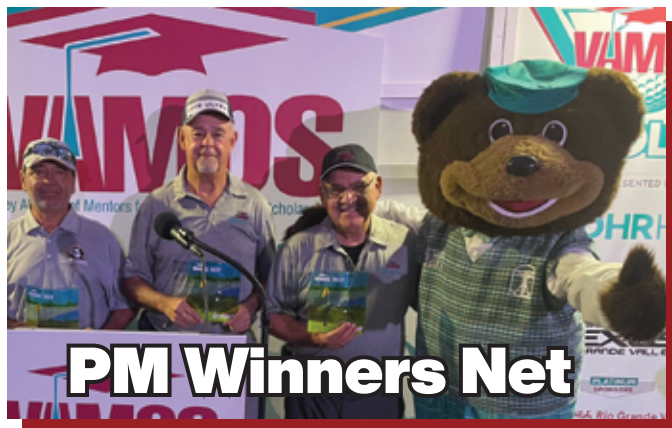
PM Winners Net