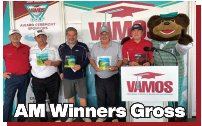
AM Winners Gross