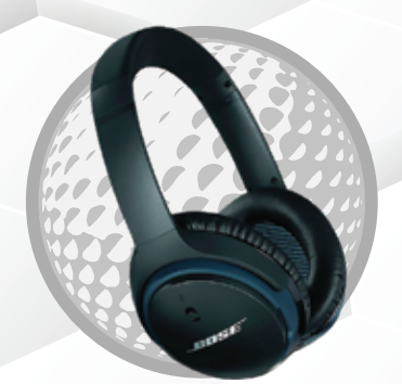
BOSE WIRELESS HEADPHONES

MUST BE 18 YEARS OR OLDER TO PURCHASE TICKET OR WIN. WINNER IS RESPONSIBLE FOR TAX AND LICENSE OF THE VEHICLE. NEED NOT BE PRESENT TO WIN. PRIZES MUST BE PICKED UP WITHIN 30 DAYS OF RAFFLE AND UPON PRESENTING PROPER ID. ALL IMAGES USED FOR ILLUSTRATIVE PURPOSES ONLY. WWW.VAMOSSCHOLARS.ORG